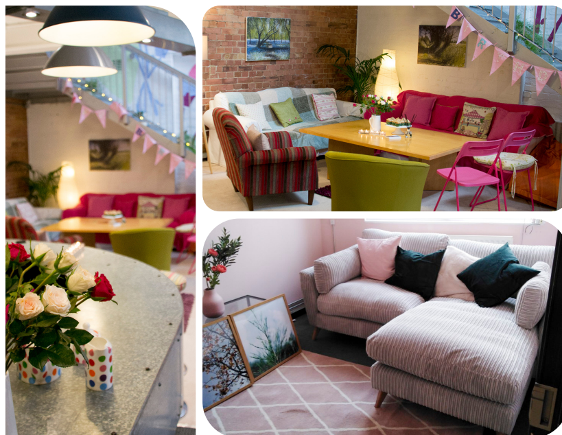
The Encompass Drop-In, a warm, inviting, calming refuge - inspiration for our mobile Drop-In van.

We plan to purchase a van that is either new, or if second hand then a relatively new one, to help minimise maintenance costs in the first few years of the project, but also to increase the life of the project. Due to the major part of the project being a capital purchase, the running costs of the project will significantly decrease after the initial purchase and modification. We regularly maintain all of our vehicles to ensure they meet and exceed health and safety requirements.